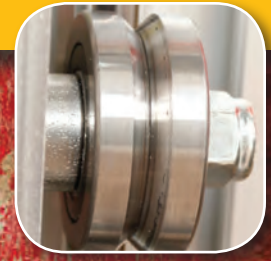
Dual V-track & Bearing