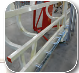
New Frame Design