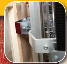
Material Pressure System

“Our Safety Speed Panel Saws are the most reliable, essential and flexible tools we have.”