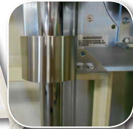
Double Bearings with Cover