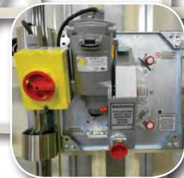
Worm Drive Motor