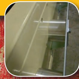
Aluminum Wheels vs. Plastic

—Les Leet, Keystone Tool and Dye, Westons Mills, NY